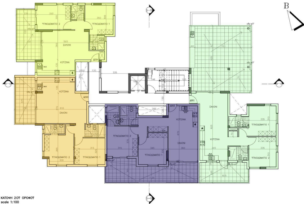
ΚΑΤΩΗ 2ΟΤ ΟΡΟΦΟΤ scale 1:100