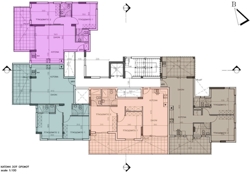
ΚΑΤΩΗ 3ΟΤ ΟΡΟΦΟΤ scale 1:100