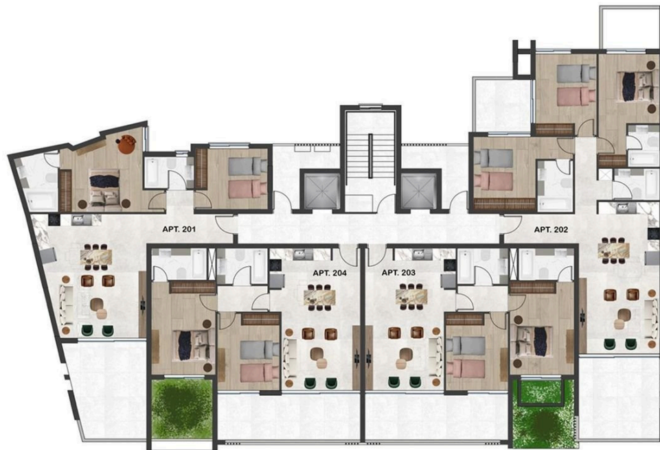
1st, 2nd , 3rd floor layout