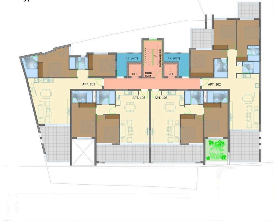
Typical floor distribution