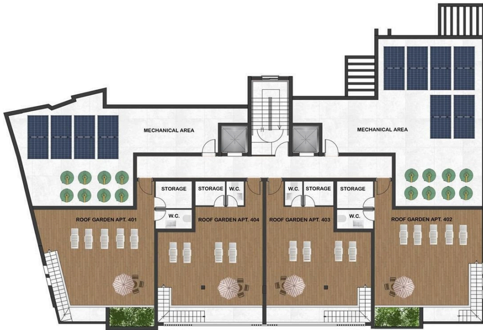
Rooftop terrace layout