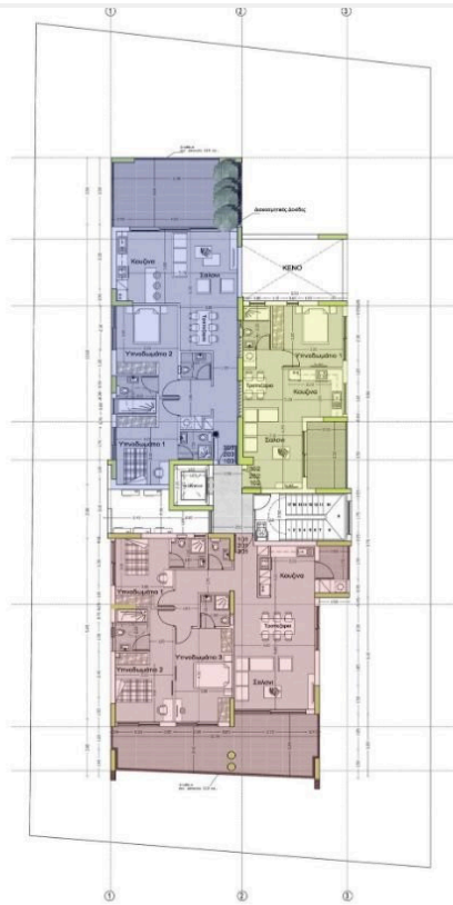
ΚΑΤΟΨΗ 2ου ΟΡΟΦΟΥ