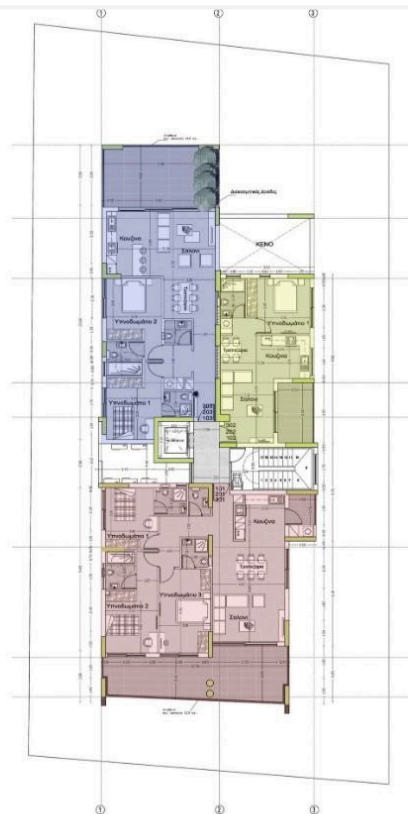
ΚΑΤΟΨΗ 3ου ΟΡΟΦΟΥ