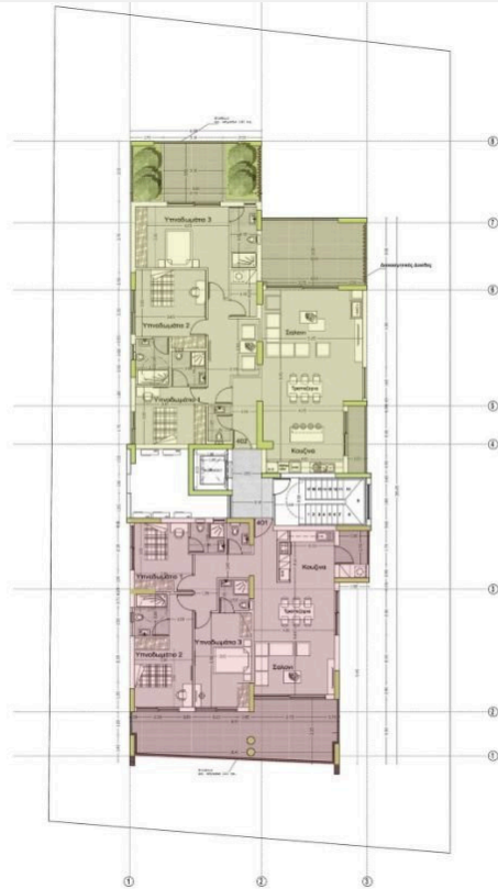
ΚΑΤΟΨΗ 4ου ΟΡΟΦΟΥ