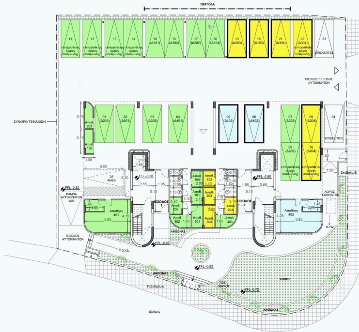
01 ΠΡΟΤΕΙΝΟΜΕΝΟ ΧΩΡΟΤΑΞΙΚΟ / ΚΑΤΩΗ ΙΣΟΓΕΙΟ 001 Κλίμακα 1: 200