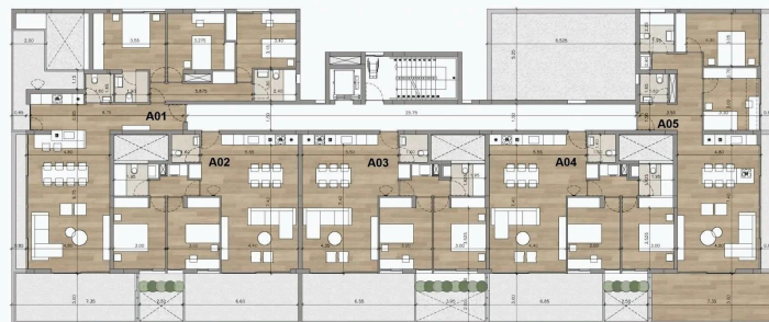
FIRST FLOOR ☒