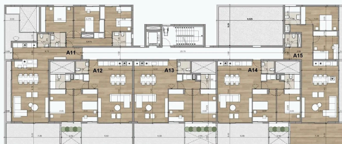
THIRD FLOOR ☒