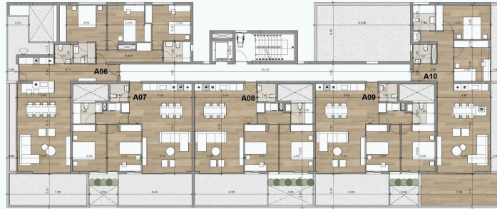
SECOND FLOOR ☒