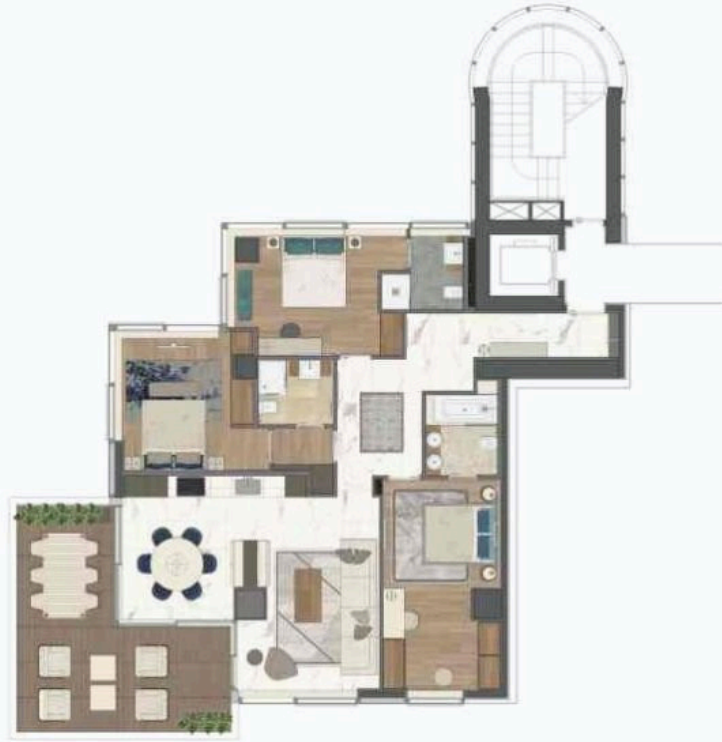
Floor 5 Apartment 501