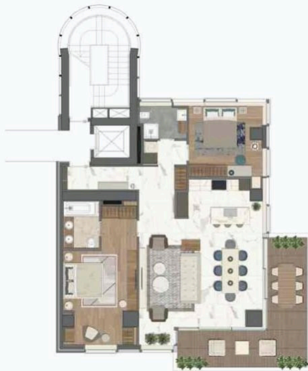
Floor 4, 8 Apartments 402, 802