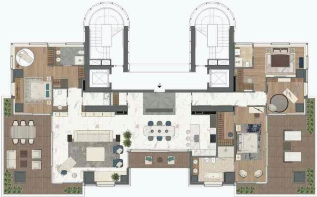
Floor 1, 2 Apartments 101, 201