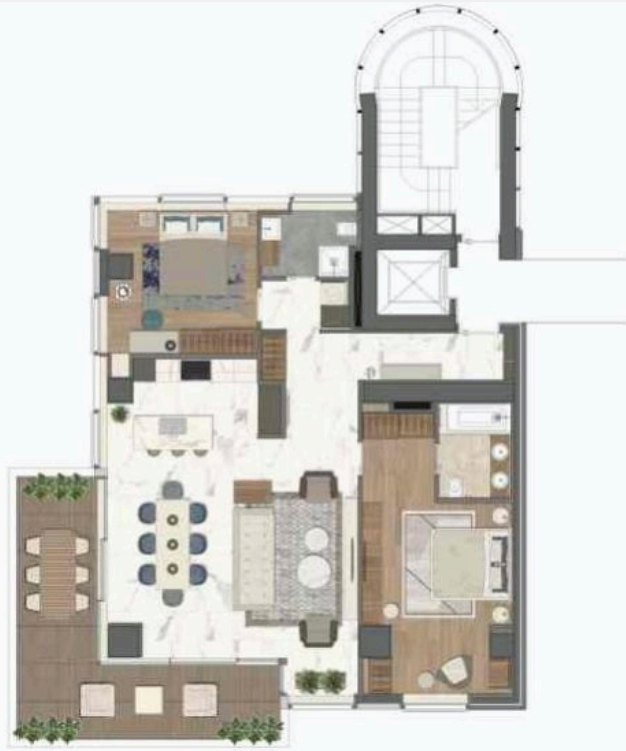
Floor 4, 8 Apartments 401, 801