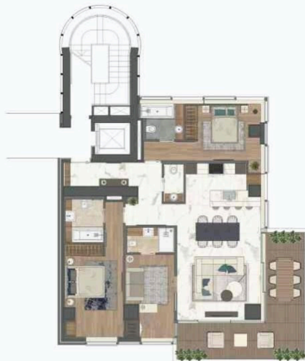
Floor 3 Apartment 302