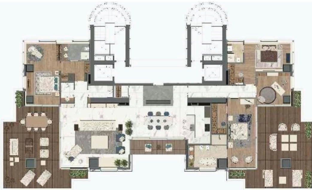
Floor 9 Apartment 901