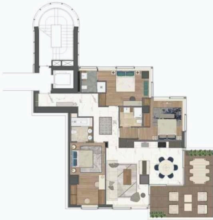
Floor 5 Apartment 502