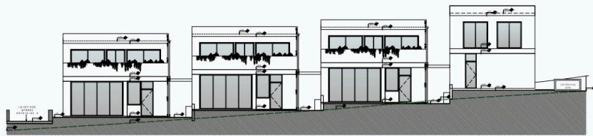
2 ΔΥΤΙΚΗ ΟΨΗ 1:200@A3