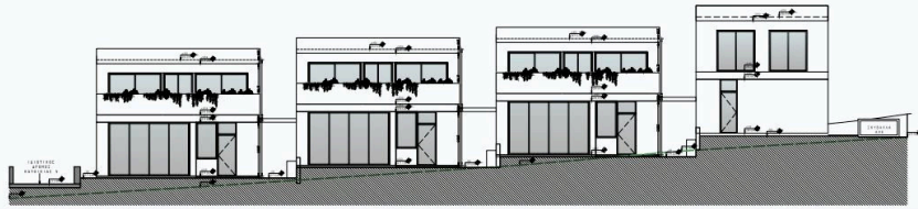
2 ΔΥΤΙΚΗ ΟΨΗ 1:200@A3