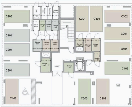
ground floor block c