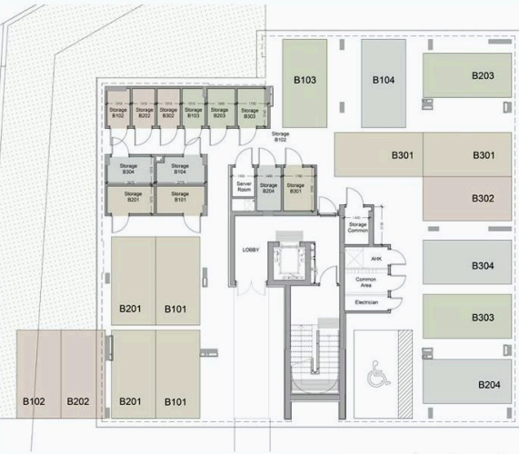
ground floor block b