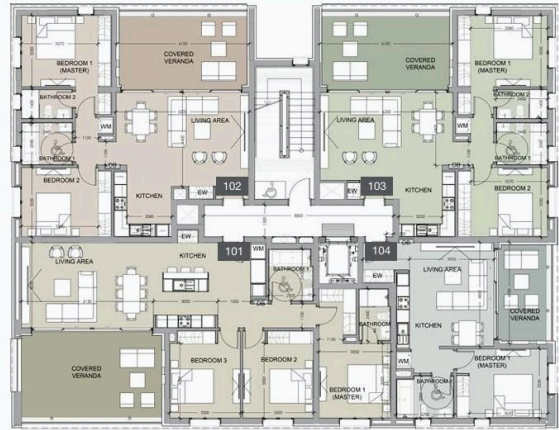
floor 1 block c