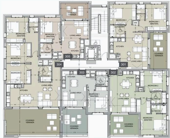
floor 3 block a