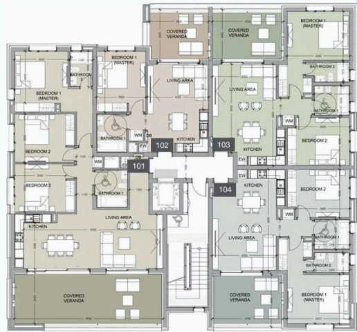
floor 1 block b