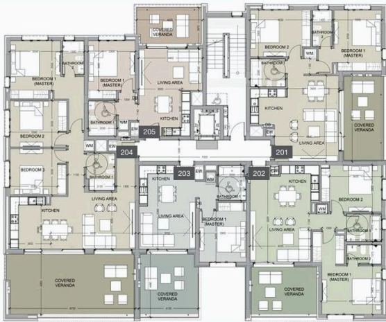
floor 2 block a