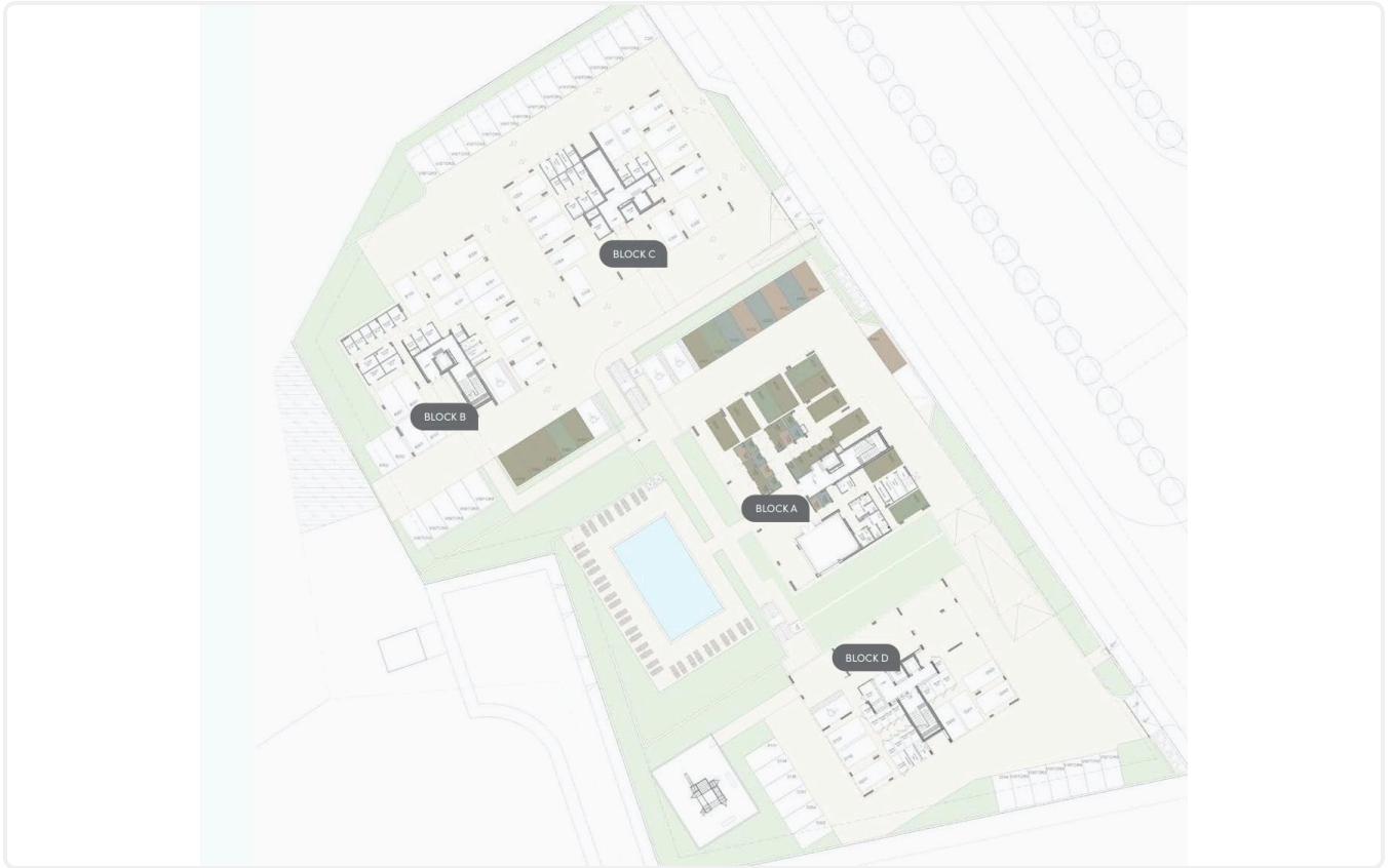
ground floor block a