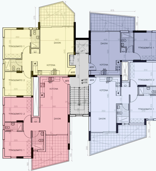
ΚΑΤΟΨΗ 1 ΟΤ ΟΡΟΦΟΥ ΠΟΛΥΚΑΤΟΙΚΙΑ 2