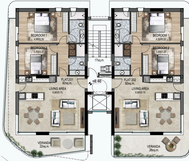
2nd Floor Plan Scale 1:100