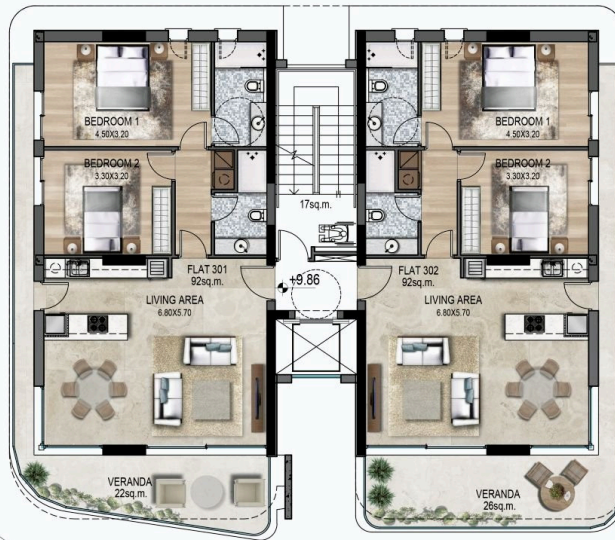
3rd Floor Plan Scale 1:100