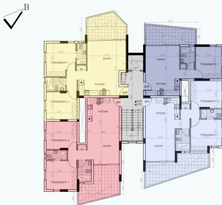
ΚΑΤΟΨΗ 1 Ο Τ ΟΡΟΦΟΥ ΠΟΛΥΚΑΤΟΙΚΙΑ 2