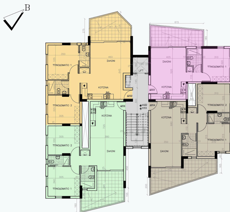
ΚΑΤΟΨΗ 2 Ο Τ ΟΡΟΦΟΥ ΠΟΛΥΚΑΤΟΙΚΙΑ 2