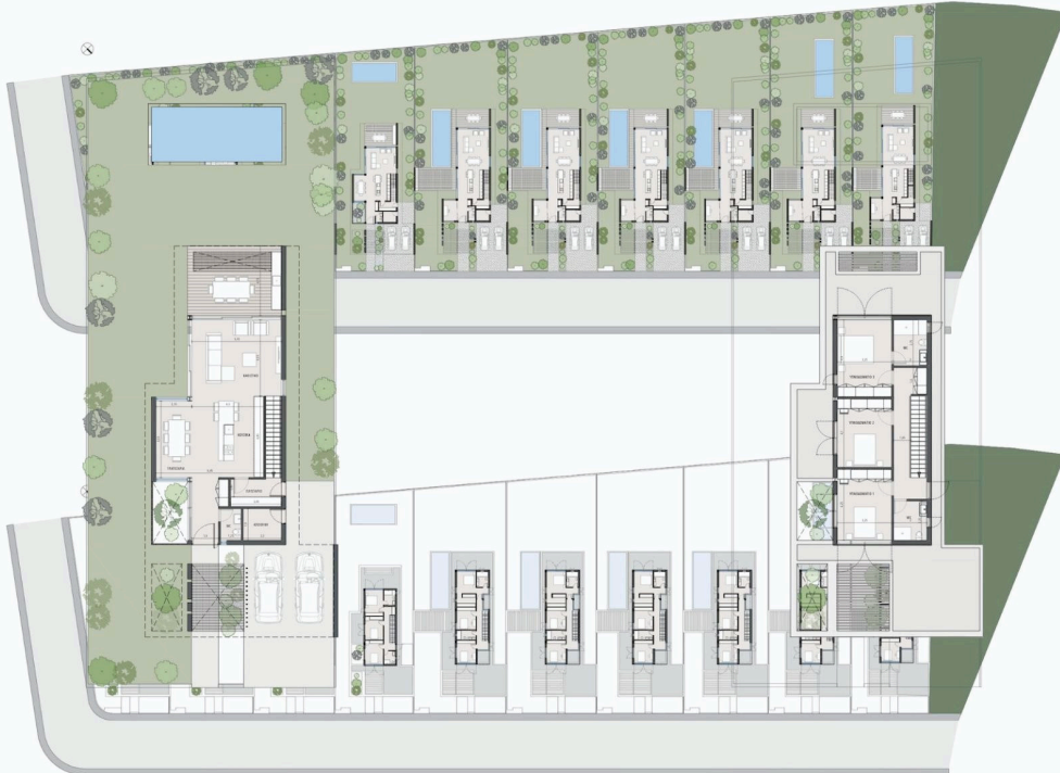
TYPE A 1ος ΟΡΟΦΟΣ 1st FLOOR