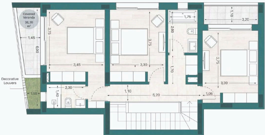
VILLA B 1ST FLOOR