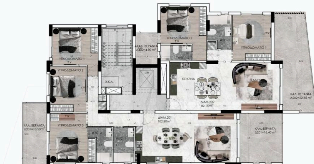
ΚΑΤΩΨΗ 2ου ΟΡΟΦΟΥ / 2nd FLOOR