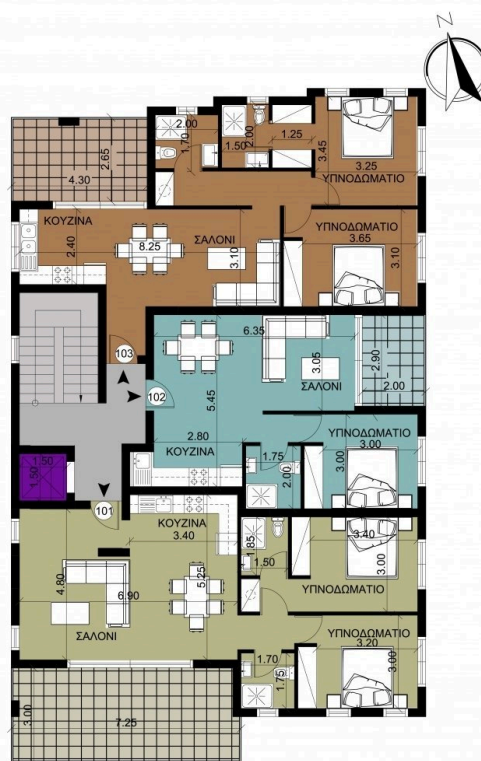
ΚΑΤΟΨΗ 1ου ΟΡΟΦΟΥ