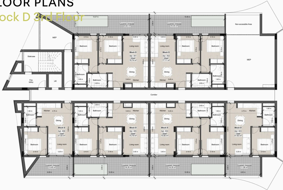
Block D - 3rd Floor