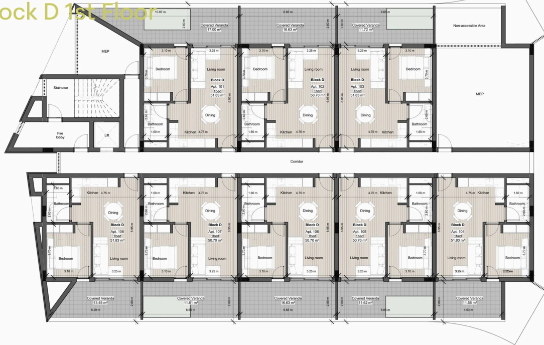
Block D - 1st Floor