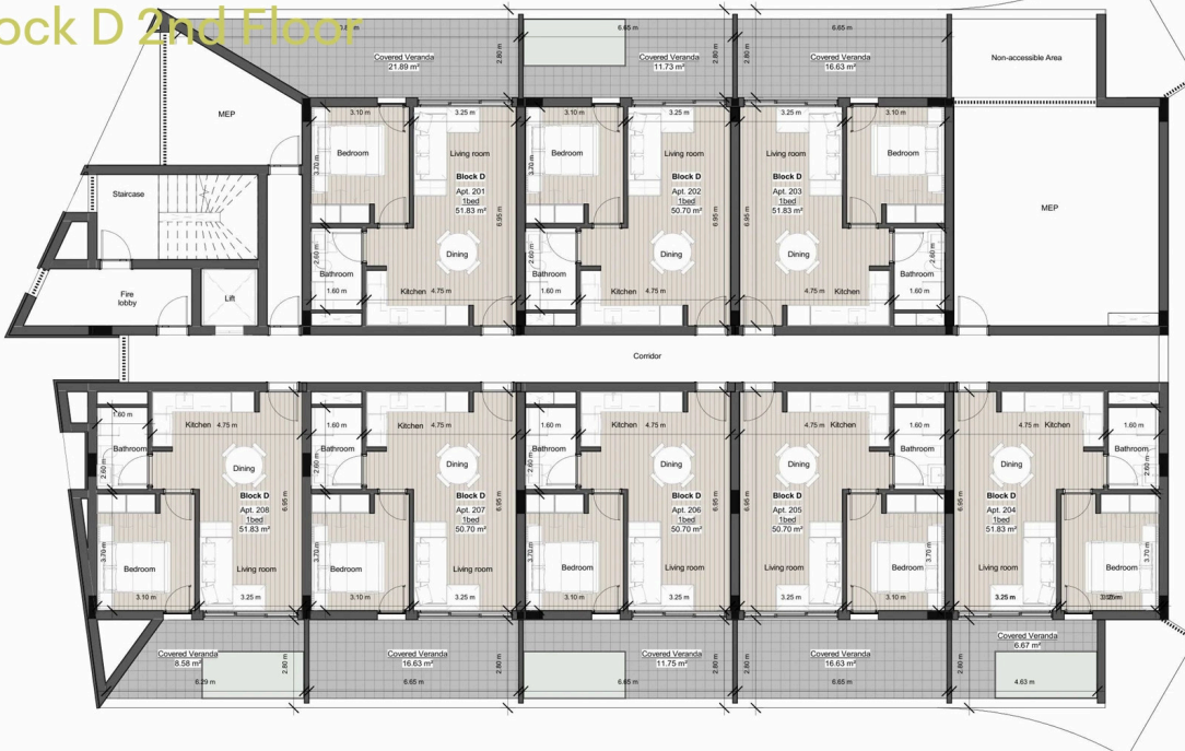
Block D - 2nd Floor