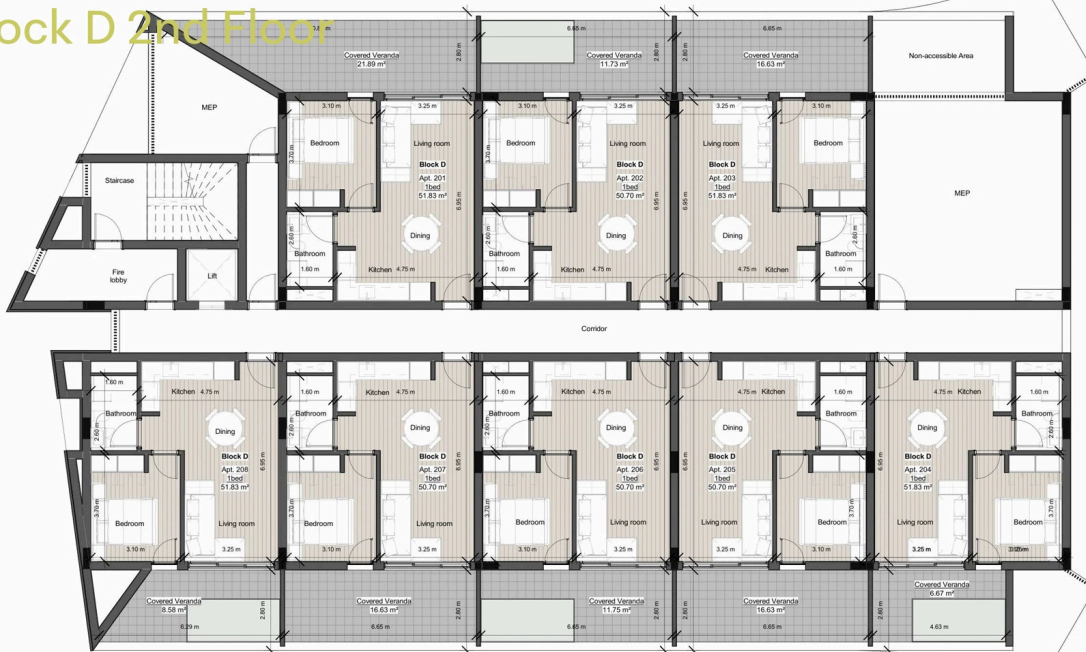
Block D - 2nd Floor