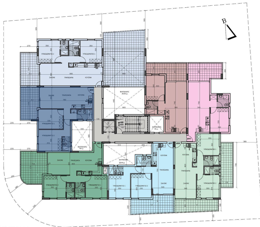
ΚΑΤΟΨΗ 2ΟΥ ΟΡΟΦΟΥ scale 1:150