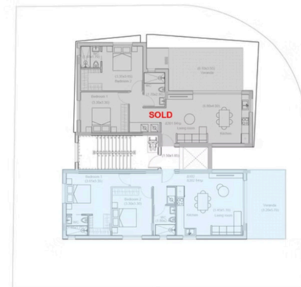
Κατόψη 3ος όροφος