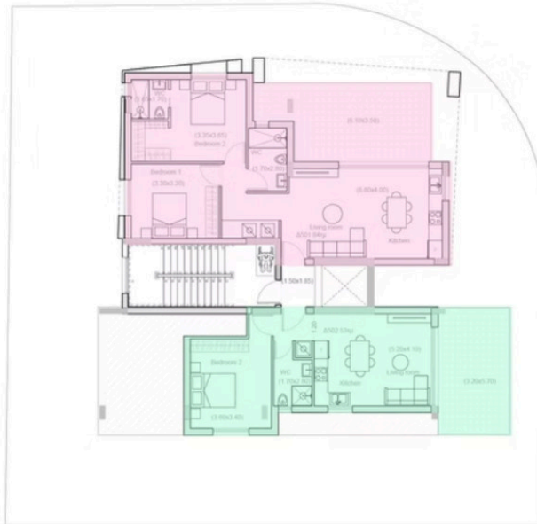
Κατόψη 5ος όροφος