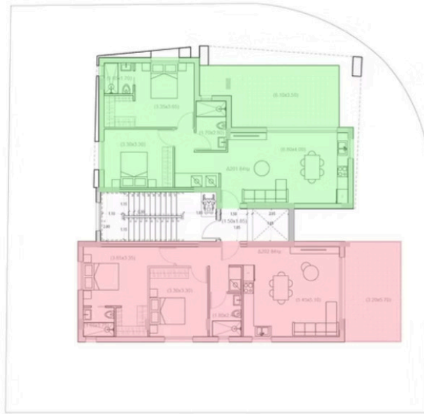
Κατόψη 2ος όροφος