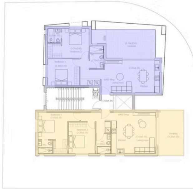
Κατόψη 4ος όροφος