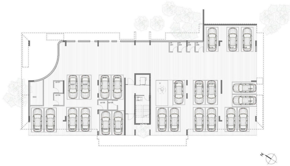
A001-BLOCK B PILOT FLOOR 1:100