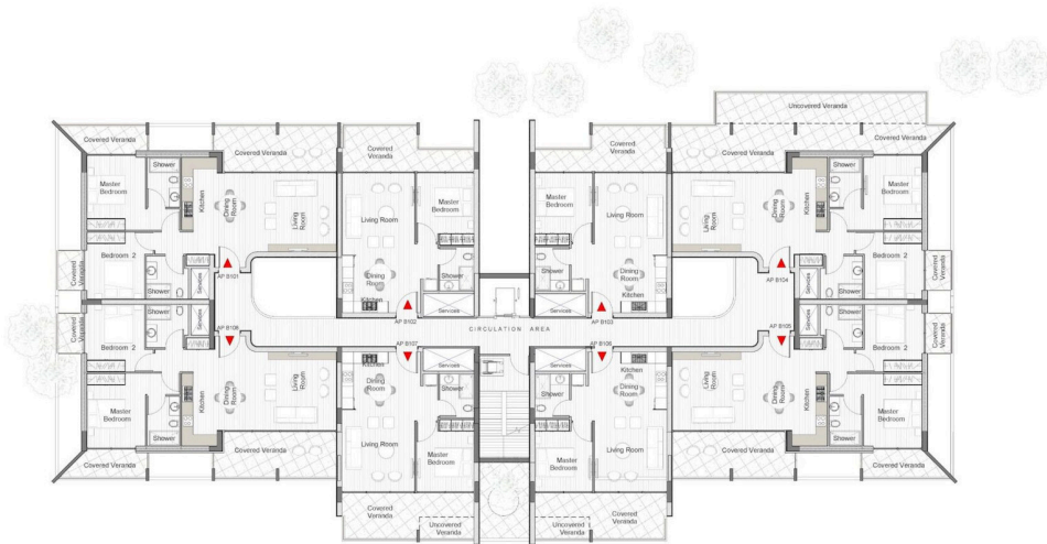
A002-BLOCK B FIRST FLOOR 1:100