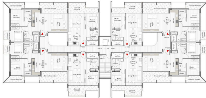
A003-BLOCK B SECOND FLOOR