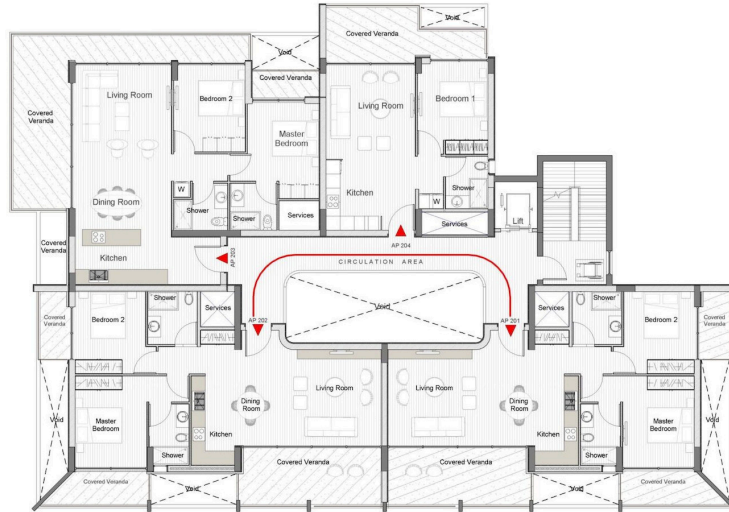
A003-BLOCK A SECOND FLOOR