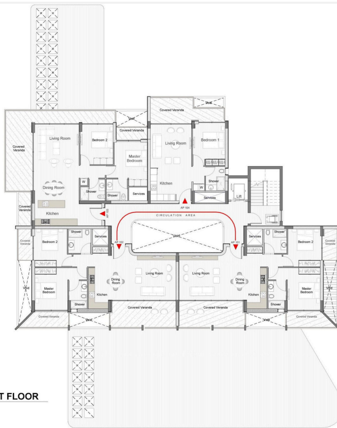
A002-BLOCK A FIRST FLOOR 1:100