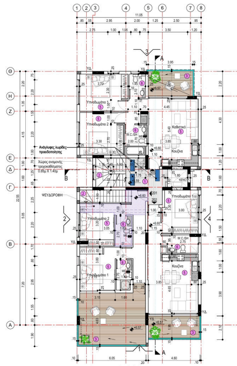
ΚΑΤΩΦΗ 2ου ΟΡΟΦΟΥ