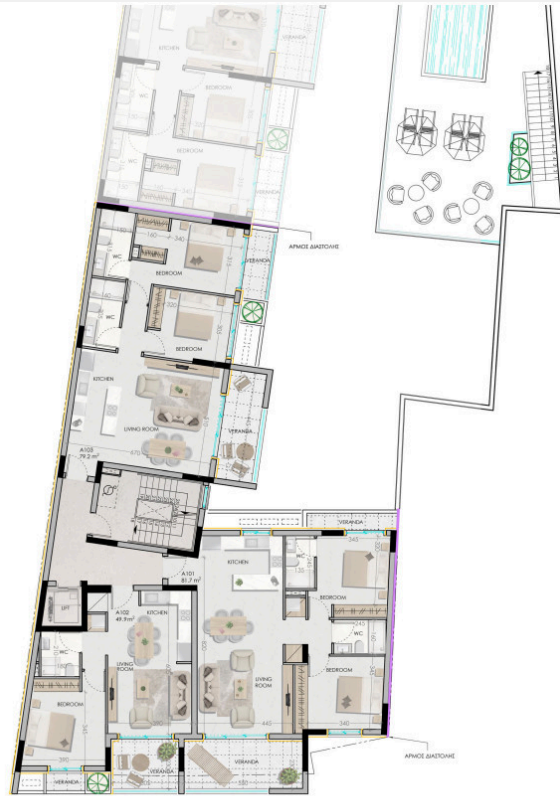
1ST FLOOR PLAN - BLOCK A