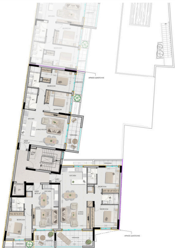
2ND FLOOR PLAN - BLOCK A