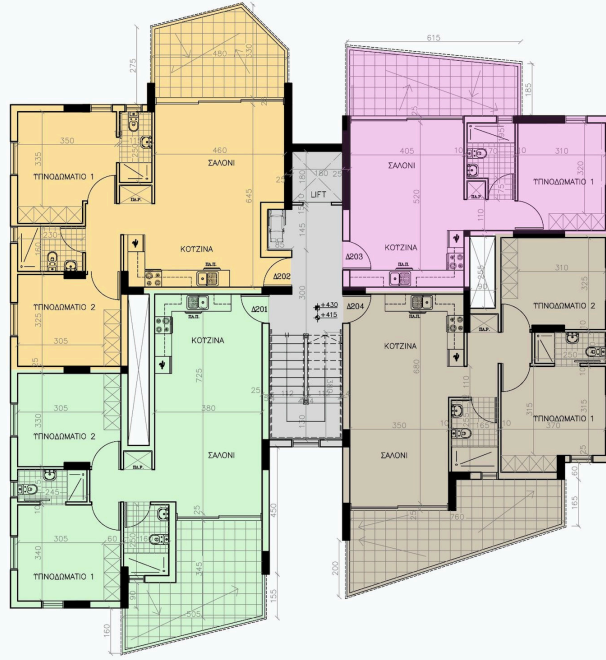
ΚΑΤΟΥΗ 20 Η ΟΡΟΦΟΥ ΠΟΛΥΚΑΤΟΙΚΙΑ 2