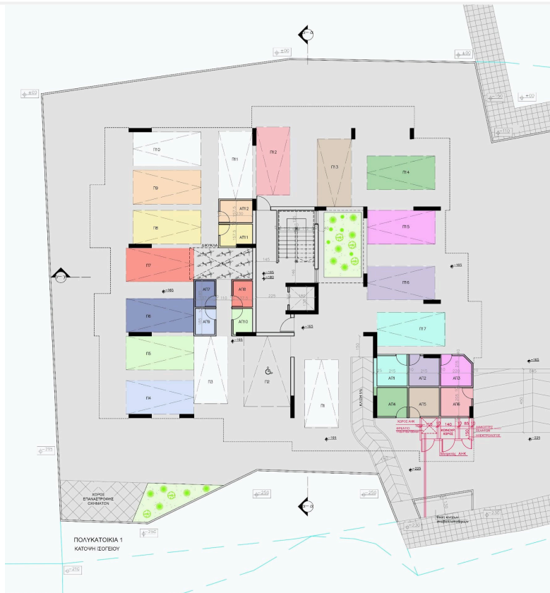
ΠΟΛΥΚΑΤΟΙΚΙΑ 1 ΚΑΤΟΥΗ 1 Η ΟΡΟΦΟΥ