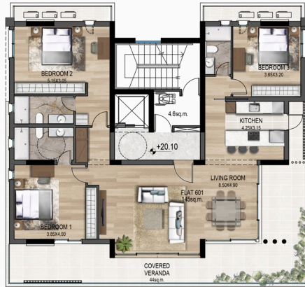
6th FLOOR PLAN SCALE 1:100 A3