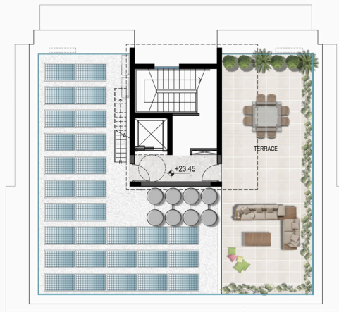
ROOF FLOOR PLAN SCALE 1:100 A3