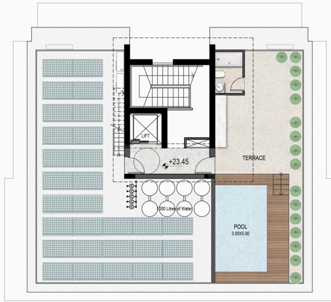
Roof Floor Plan Scale 1:100