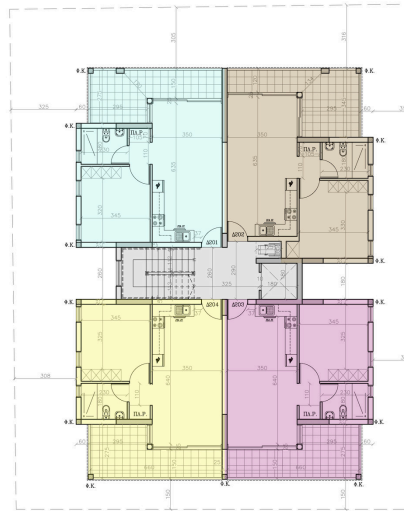
KATOVH 20V OPOBOY Scale 1:100