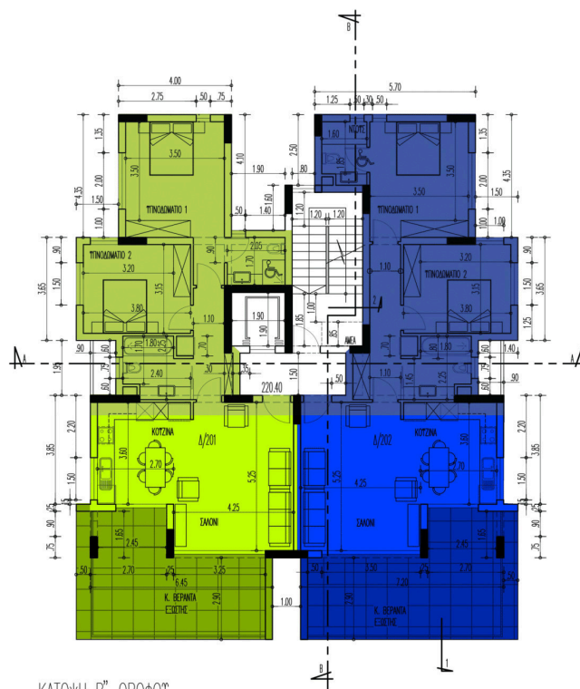
KATOVH B' OPOΦOY