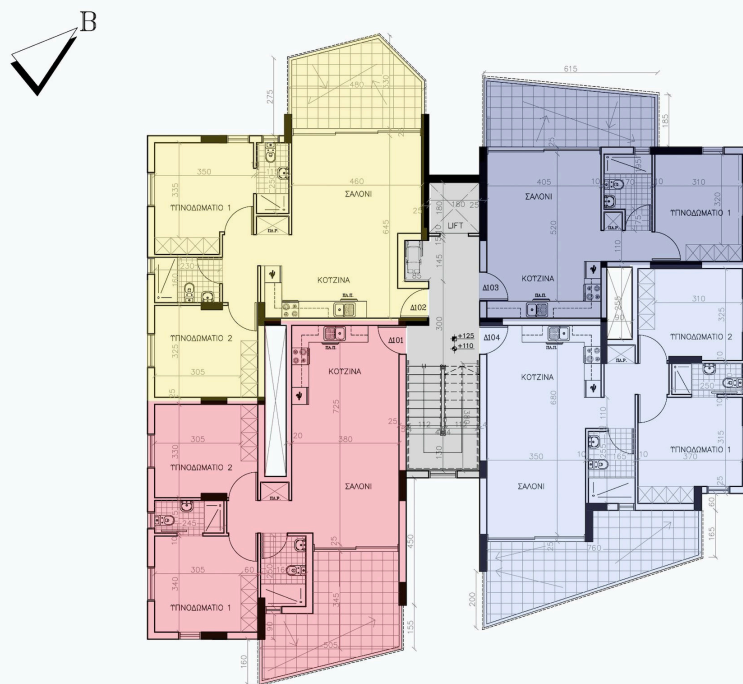
ΚΑΤΟΨΗ 1 Ο Τ ΟΡΟΦΟΥ ΠΟΛΥΚΑΤΟΙΚΙΑ 2