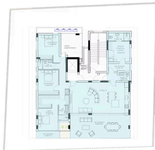
ΚΑΤΟΨΗ 2ου ΟΡΟΦΟΥ