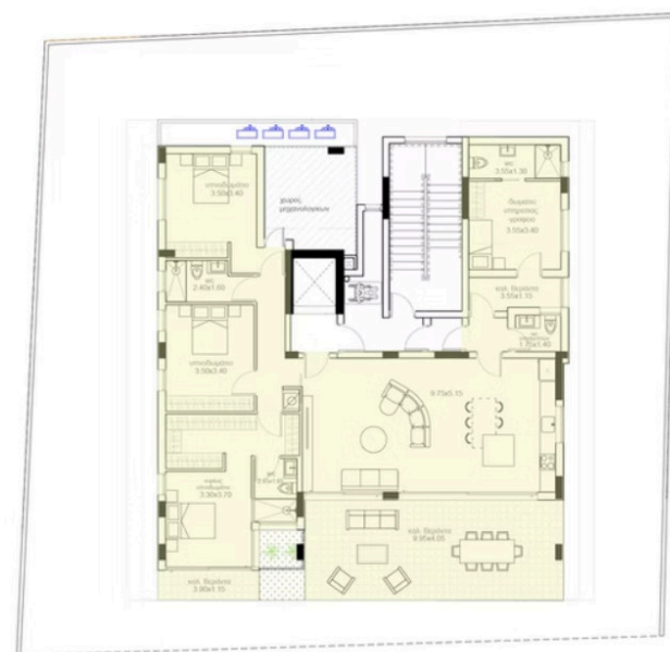
ΚΑΤΟΨΗ 1ου ΟΡΟΦΟΥ