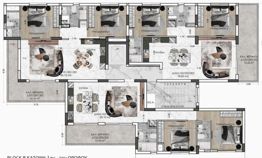
BLOCK B ΚΑΤΟΨΗ 1ου - 3ου ΟΡΟΦΟΥ