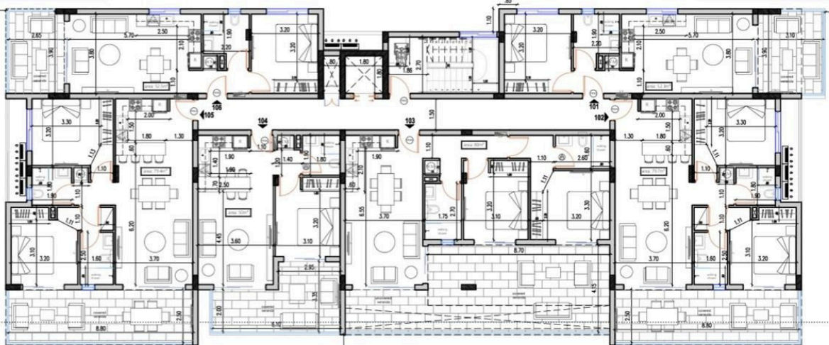
105 – 2 bedroom