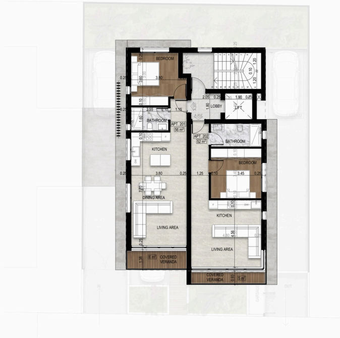
2. SECOND FLOOR PLAN 1:100