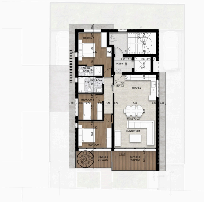
3. THIRD FLOOR PLAN 1:100