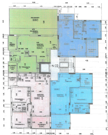
ΚΑΤΟΧΗ 2ου ΟΡΟΦΟΥ 00.000.2.00