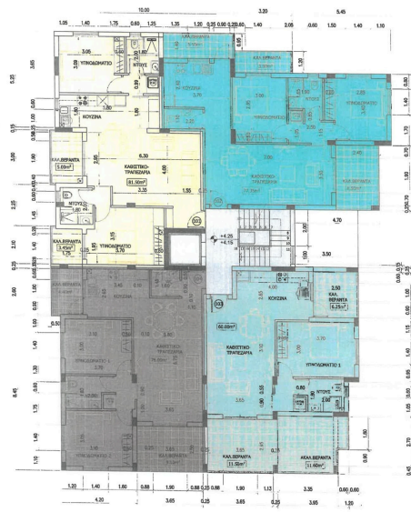
ΚΑΤΟΧΗ 1ου ΟΡΟΦΟΥ 00.000.1.00