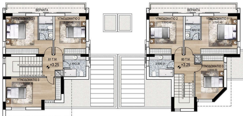
First Floor Scale 1:100