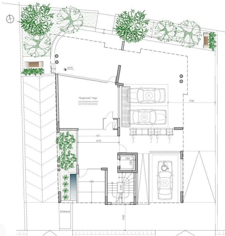
FLOOR PLANS [Ground Floor]