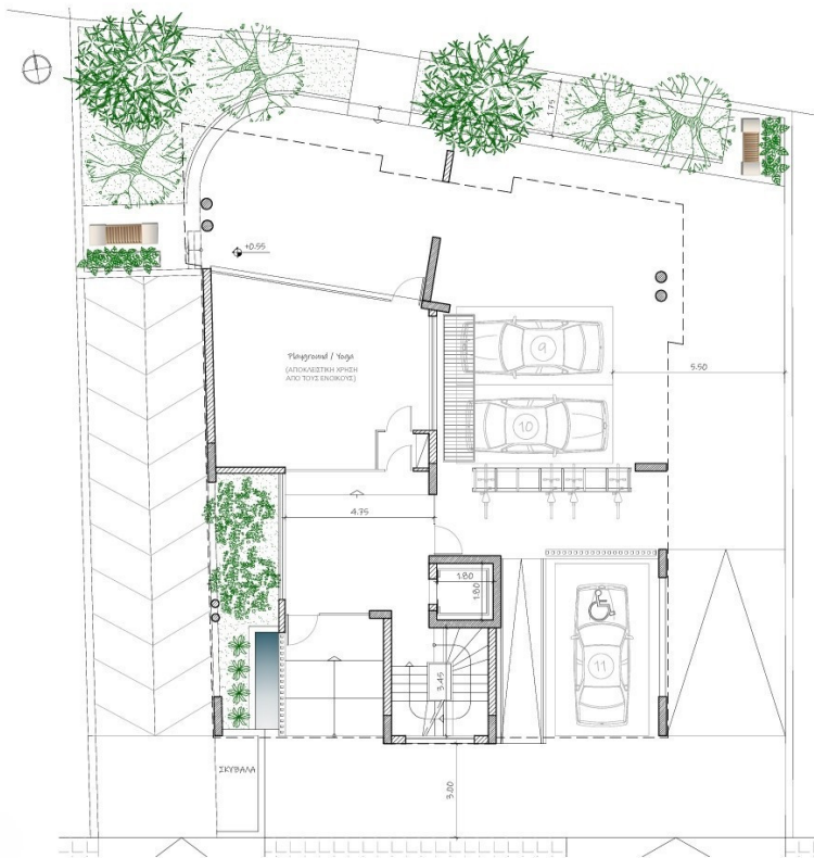
FLOOR PLANS [Ground Floor]