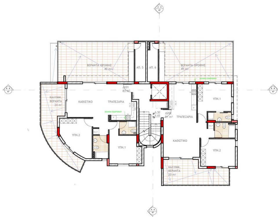
ΚΑΤΟΨΗ 20Υ ΟΡΟΦΟΥ ΚΑΙΜΑΚΑ 1 : 100