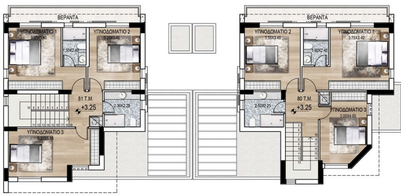
First Floor Scale 1:100