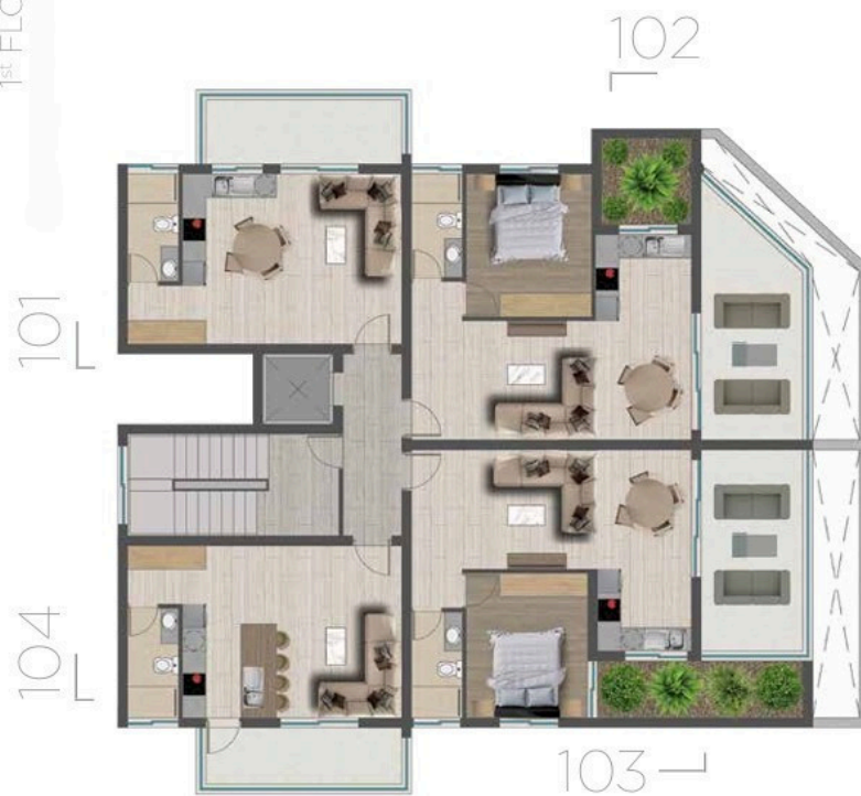
FLOOR PLANS 1 st FLOOR