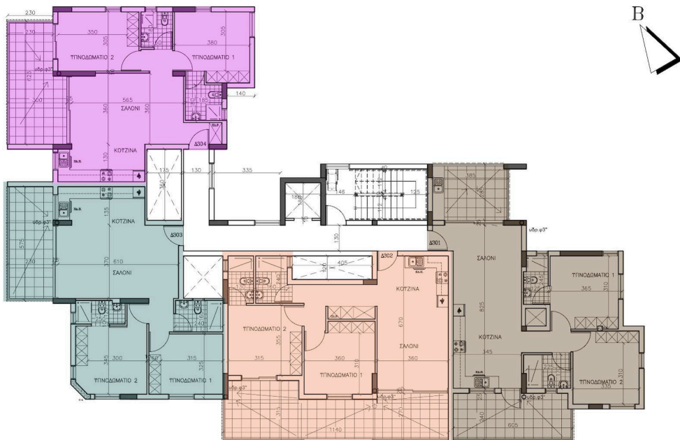
ΚΑΤΟΨΗ 3ΟΥ ΟΡΟΦΟΥ scale 1:100