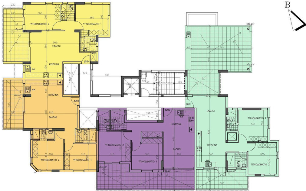
ΚΑΤΟΨΗ 2ΟΥ ΟΡΟΦΟΥ scale 1:100