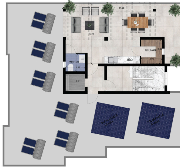
Roof Garden Plan - Block A