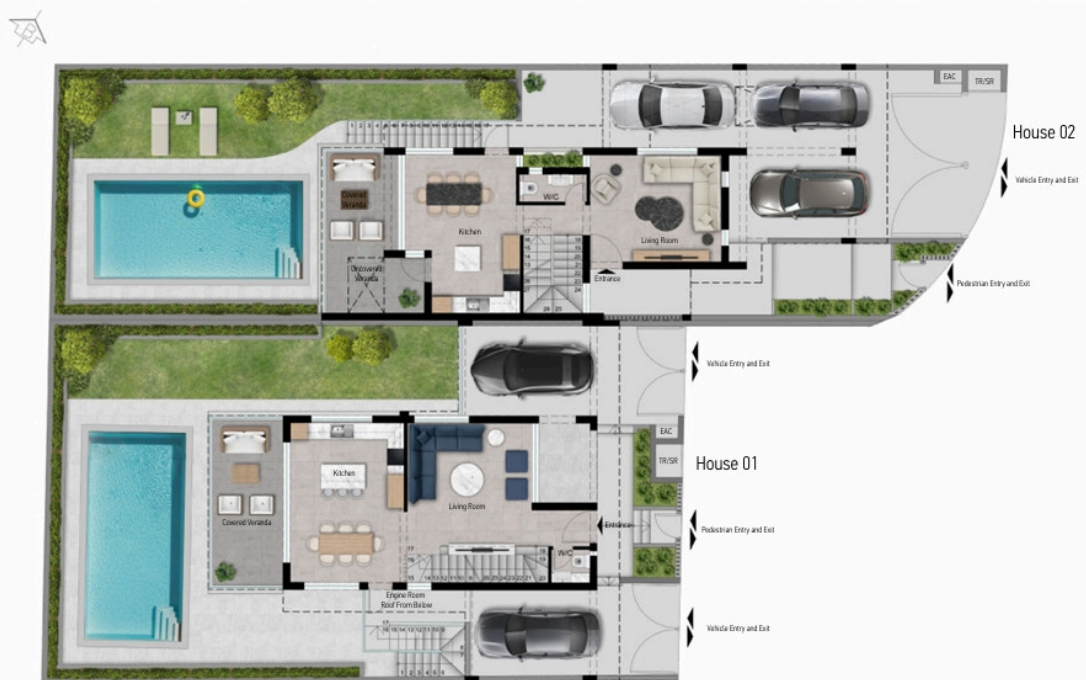
GROUND FLOOR FLOOR PLAN