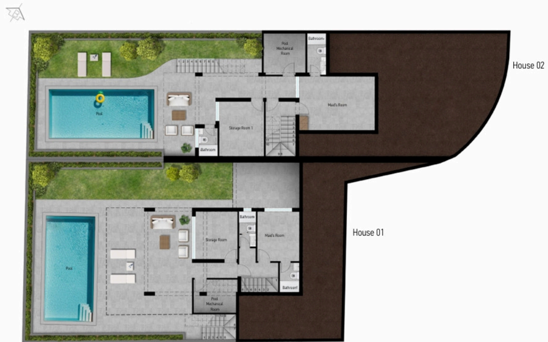
BASEMENT FLOOR PLAN