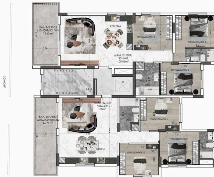
BLOCK A KATOYH 1ou - 4ou OPOΦOY / 1st - 4th FLOOR PLAN