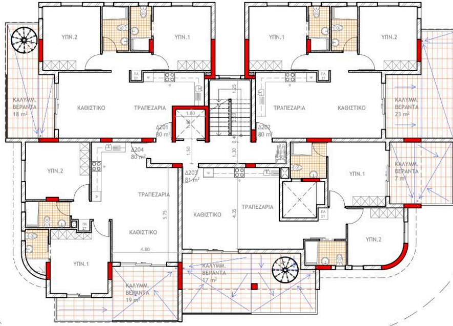
ΚΑΤΟΨΗ 2ΟΥ ΟΡΟΦΟΥ ΚΑΙΜΑΚΑ 1 : 100