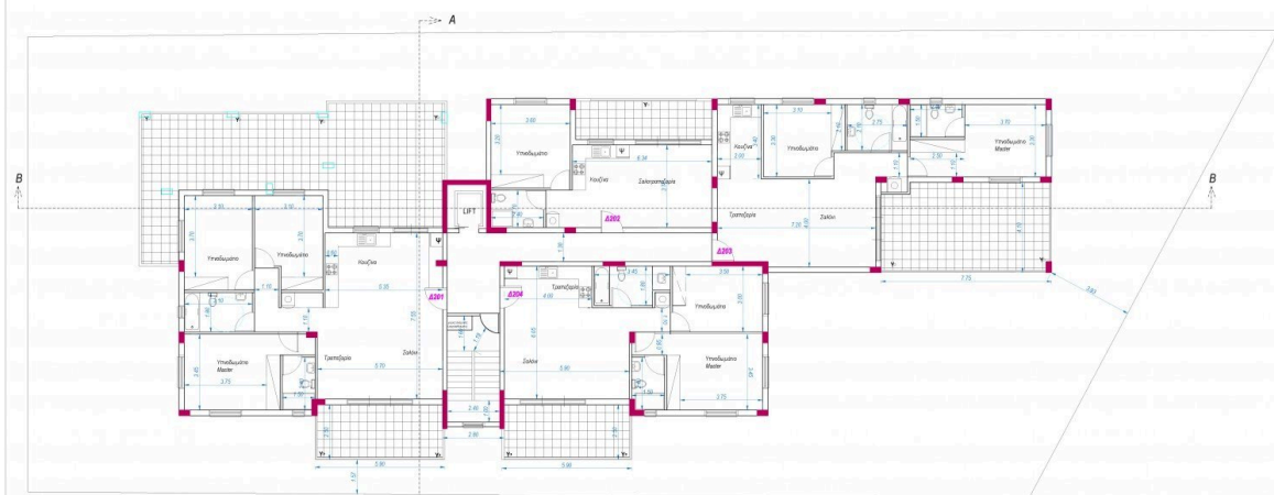
ΚΑΤΩΗ 2ου ΟΡΟΦΟΥ