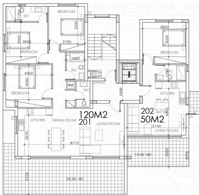
ΚΑΤΟΨΗ 2ΟΥ ΟΡΟΦΟΥ 1:100@A3