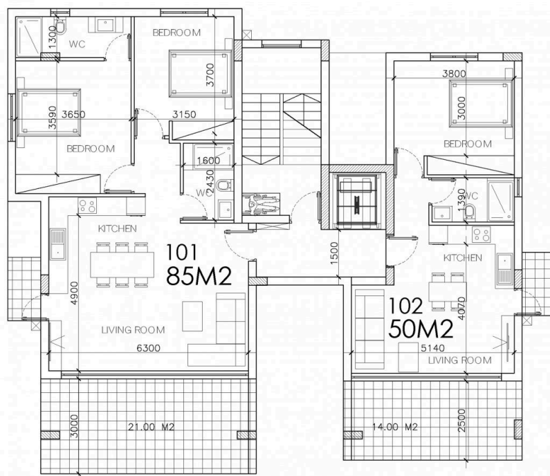
ΚΑΤΟΨΗ 1ΟΥ ΟΡΟΦΟΥ 1:100@A3