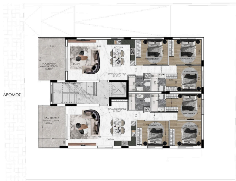
ΚΑΤΟΨΗ 1ου - 3ου ΟΡΟΦΟΥ / 1st - 3rd FLOOR