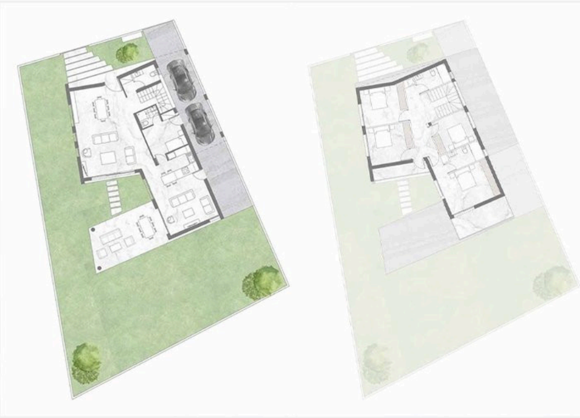
FLOOR PLANS - GROUND FLOOR